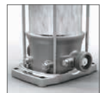
External thread connector Movitec VE