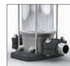
Victaulic coupling Movitec V(S)V