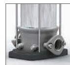
Oval flange Movitec VS