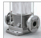
Round flange Movitec VSF