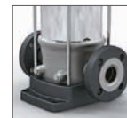
Round flange Movitec VF

Min. NPSH data for low-NPSH impeller (available for sizes 2, 4, 6, 10 & 15 only)