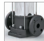
Round flange Movitec VCF