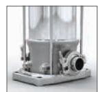
Triclamp coupling Movitec V(S)T