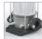
Oval flange Movitec V