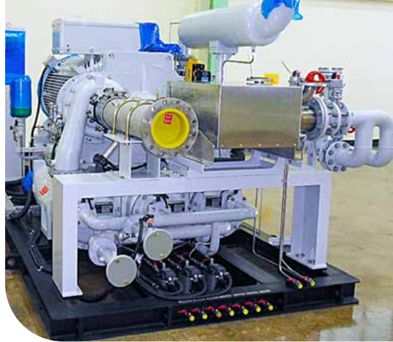
The compact design of Alfa Laval gas-to-liquid heat exchangers makes them easy to integrate in compressed air systems, as in this example from another auto industry leader in South Korea.

In addition to ensuring lower air-side pressure drop, Alfa Laval gas-to-liquid technology is also much more efficient than more traditional shell-and-tube solutions. It is also far more compact, with all connections integrated inside the unit and no additional pressure-resistant housing being required for dependable operation. This makes it simple to install for a variety of duties without increasing the footprint of the overall system.